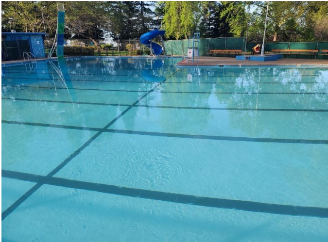
Figure 3. Ray Lockridge has been busy balancing the chemicals at the Paradise Pool.