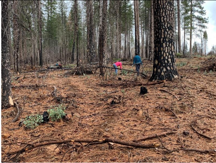
Figure 7. A couple volunteers in action.