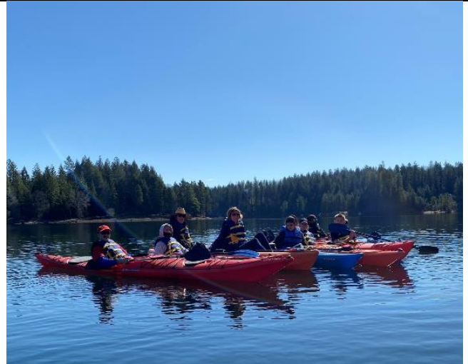
Figure 4. Field Trip Participants on Paradise Lake in Kayaks.