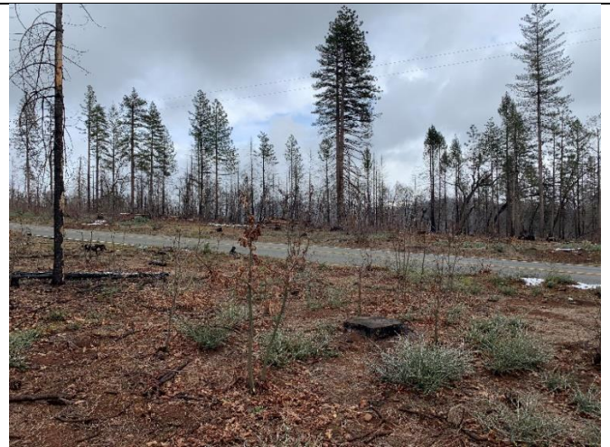
Figure 6. After - Black oak pruning.