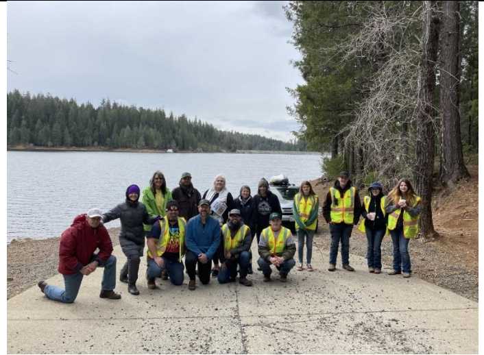
Figure 8. Polar Paddlefest crew!