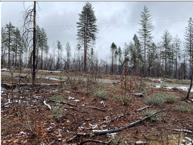
Figure 5. Before - Black oak pruning.