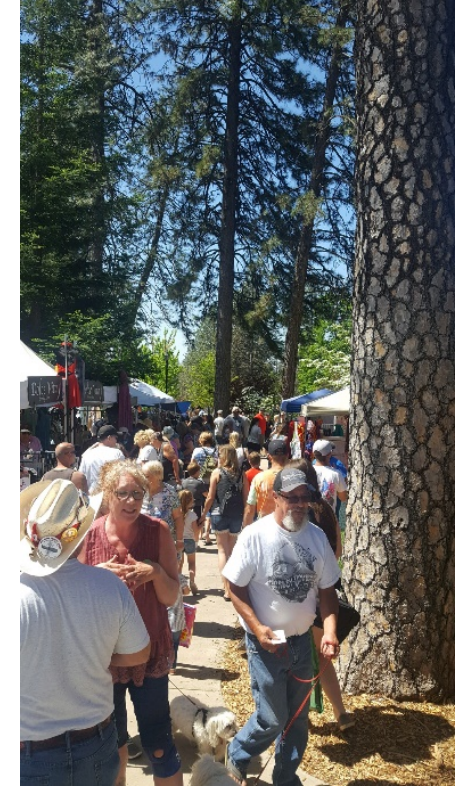
2019 Gold Nugget Craft Faire