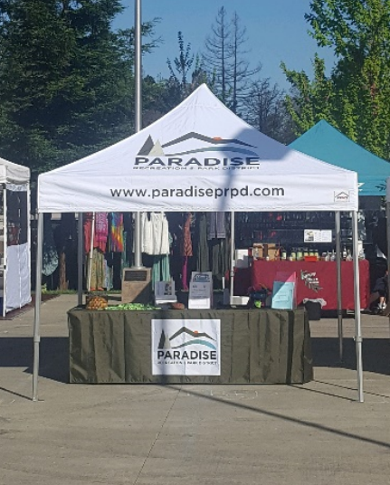
2019 Gold Nugget Craft Faire

O:\BOD\BOD_Meetings\2019\19.0508\2019.0508.BOD.District.Report.docx 5/2/2019