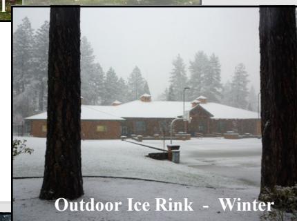
Outdoor Ice Rink - Winter