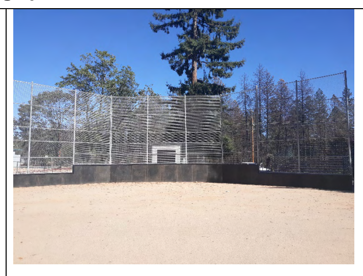
Moore Road Large Field