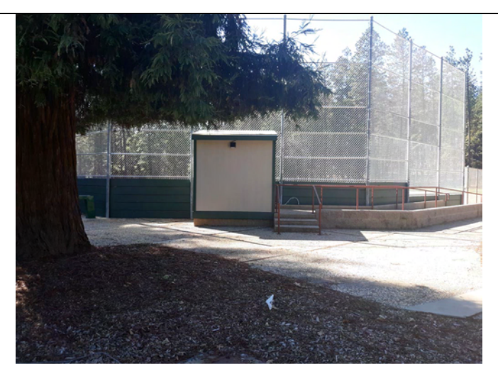
Completion of the backstop and concession stand at the Moore Road Ballpark